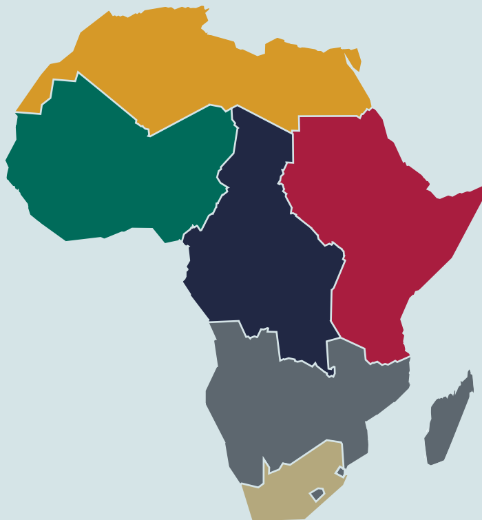
% share of number and value of PE Infrastructure deals in Africa, by region, 2012-2015